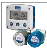
FLOW VERIFICATION & AUDITS